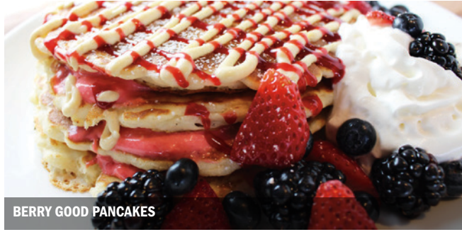
BERRY GOOD PANCAKES

Berry mascarpone, blackberry coulis, vanilla crème anglaise, fresh berries and whipped cream.