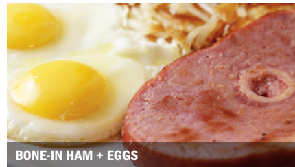
BONE-IN HAM + EGGS

Scrambled eggs, American cheese and your choice of one: sausage patties, ham, or bacon, on two fresh biscuits. Served with roasted potatoes or hashbrowns (no toast or pancakes).